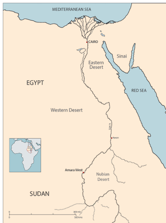
Figure 1: Location map of Amara West, northern Sudan (map: Claire Thorne).

The thirteen humeri form part of a large assemblage of faunal remains from the site of Amara West in northern Sudan (Figure 1). Founded c.1300 BC, and occupied through until around 1000BC, the town was founded as a new administrative centre to oversee the pharaonic colony of Upper Nubia (Kush). The settlement (including its cemeteries) has been the focus of a British Museum research project since 2008, under the direction of Dr Neal Spencer (see Spencer 2014; Spencer, Stevens, and Binder 2014).