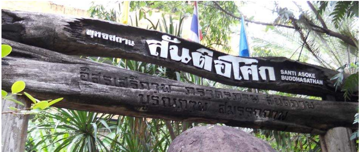
Illustration 3 - พุทธสถาน สันติ อโศก Santi Asoke Buddhist Centre, entrance arch

centre (พุทธสถาน สันติ อโศก putthothan santi asok) in Bangkok programmatically displays the mottoes of '(autonomous) liberty' (อิสระเสรีภาพ itsaseriphap), 'harmony/brotherhood' (ภราดรภาพ pharadaraphap), 'peace' (สันติภาพ santiphap), 'integrity' (บูรณภาพ buranaphap), and 'efficiency/capability' (สมรรถภาพ samatthaphap).