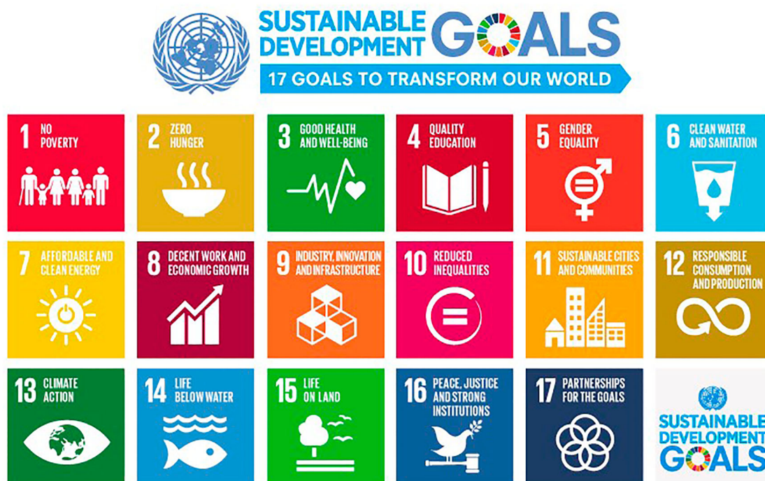
Figure 1. The UN Sustainable Development Goals ( https://www.un.org/sustainabledevelopment/ ).

Building on visual theory, user studies and design principles, cartography – which may be defined as the art, science and technology of map-making – is concerned with the effective communication of spatial information.