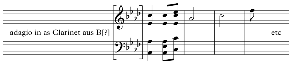
Example 4d—HCB Mh 86, folio 1r