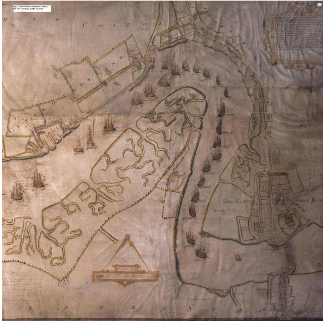
Fig.2: The Duke of Northumberland's Map of the River Medway and its environs, 1633