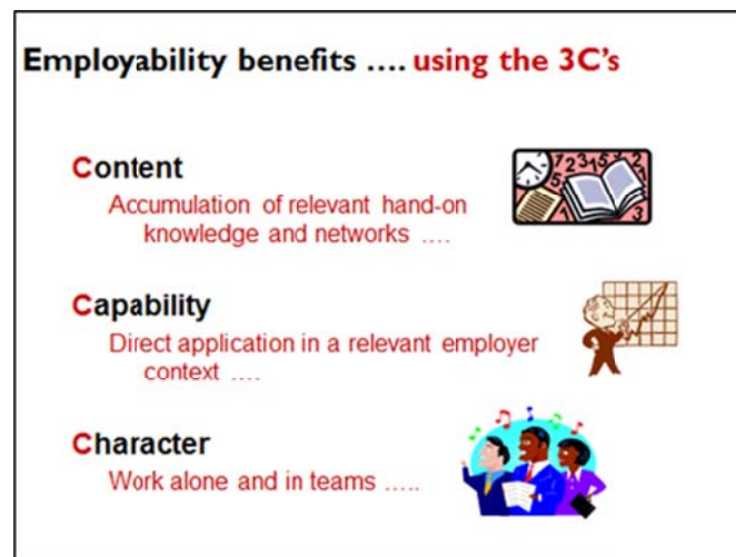
Figure 2. The employability benefits that can accrue from an employer-engaged initiative such as a project or internship