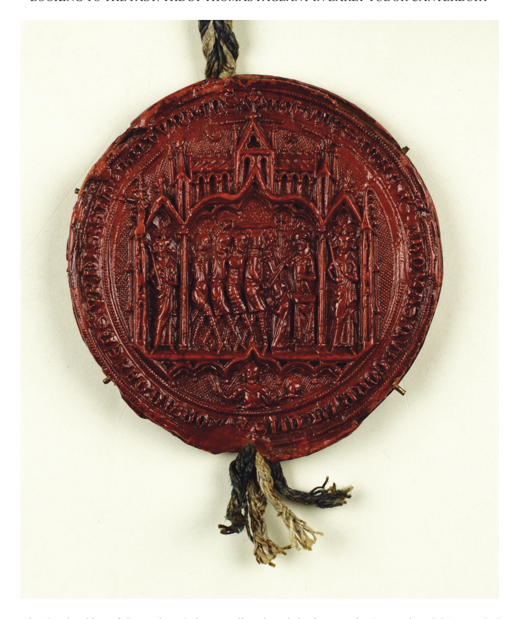
Fig. 2 The City of Canterbury's late medieval seal depicts Becket's murder. CCAL: DCc/Ch.Ant./C/1154.

pageant may be seen as helping to create the city's civic identity, their 'collective recollections of the past ... [giving] meaning to the transformed present'. 91 Most frequently, as James Fentress and Christopher Wickham have indicated, such social memory is articulated through words, yet for them ritual can also offer considerable scope where the meaning is acted out, the resulting mental images