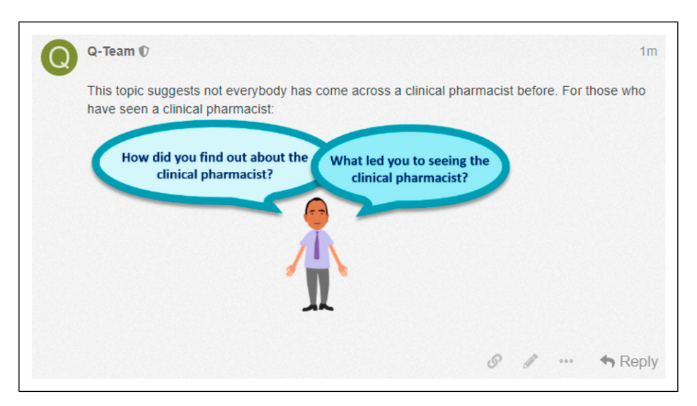
Figure 3. An example of a facilitator post using an image of a research avatar.

time. We felt it was important to have a qualitative researcher, with experience of in-person focus groups and interviews, to adopt the facilitator role (CW) supported by a senior qualitative researcher (LD). To prepare for online facilitation, CW engaged with the extant literature