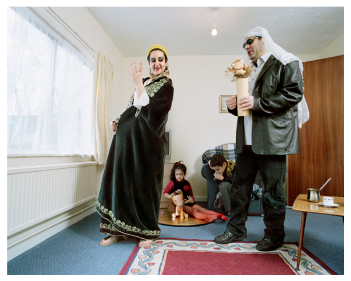
Figure 5. Sirkka-Liisa Konttinen (2007) Asylum seekers family from Lebanon. Byker Revisited

When back in Byker, after redevelopment in 2010, Konttinen notes changes in the community and the major one is people that live there now. In comparison to 1969 there are more asylum seekers from different countries, which appear in her later photographs of 'Byker Revisited'. Her images emerge as diverse representation of various nationalities as it can be seen in Figure 5. Konttinen has approached to portray new residents and their families paying more attention to their cultural belonging which is developed through photographs of residents in traditional dressings or postures. Konttinen got to know and support most of the re-developed Byker residents as if she would support herself, back when she arrived in Byker and stood on top of the Byker Hill looking for a home.