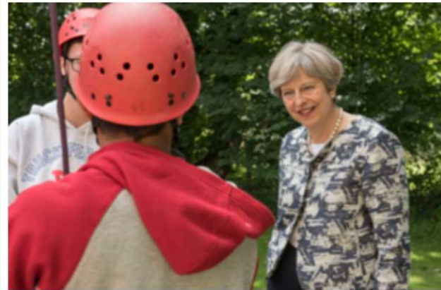
PM visited Woodlands Outdoor Education Centre, Glasbury-On-Wye Wales.

Young people to benefit from new mental health awareness course. Prime Minister's Office, 18 August 2017