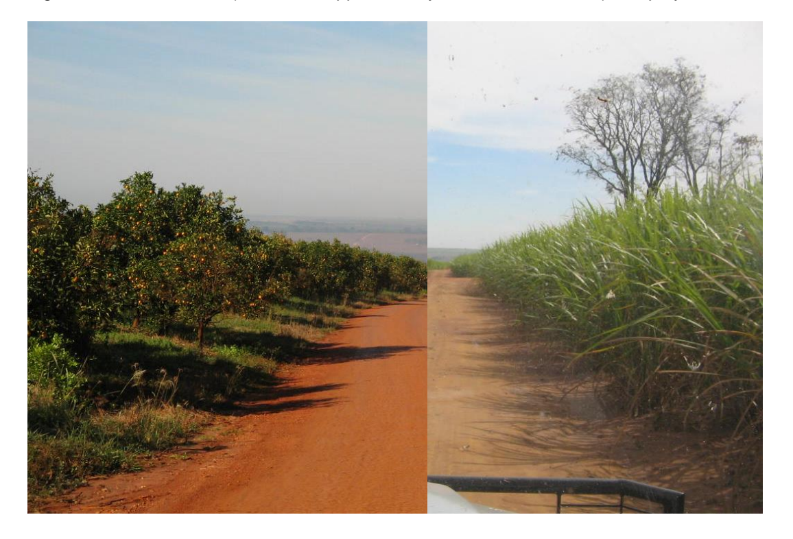
Figure 2. a. orange plantations in the Low Mogiana region are the main crop in rural areas surrounding conservation units, followed by sugar cane plantations; b. sugar cane plantations in rural São Carlos are responsible for most of the agricultural revenue.