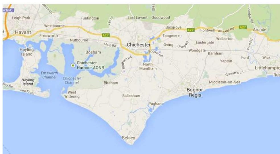
Figure 3: Selsey and the Manhood Peninsula

Part of the Chichester district in west Sussex, the town of Selsey is approximately 14 miles east of the city of Portsmouth, and lies at the southernmost point of the Manhood Peninsula (see Figure 3).