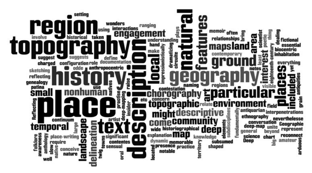
Figure 1: Word-cloud Representation of Chorography Descriptions

approaches). While I agree that such flexibility and its relationship to an ontology of immanence (see Deleuze 1963, 1995; Deleuze and Guattari 1980, 1991) is indeed quite powerful, I am also concerned with the need to provide an accessible introduction from which students and scholars can explore further.