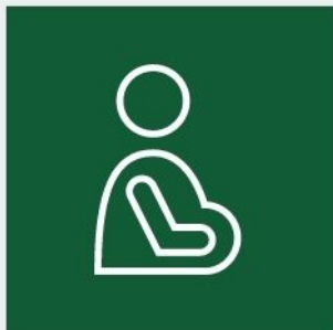
Pregnancy & Periodontitis

Visit the knowledge hub to access e-learning modules: