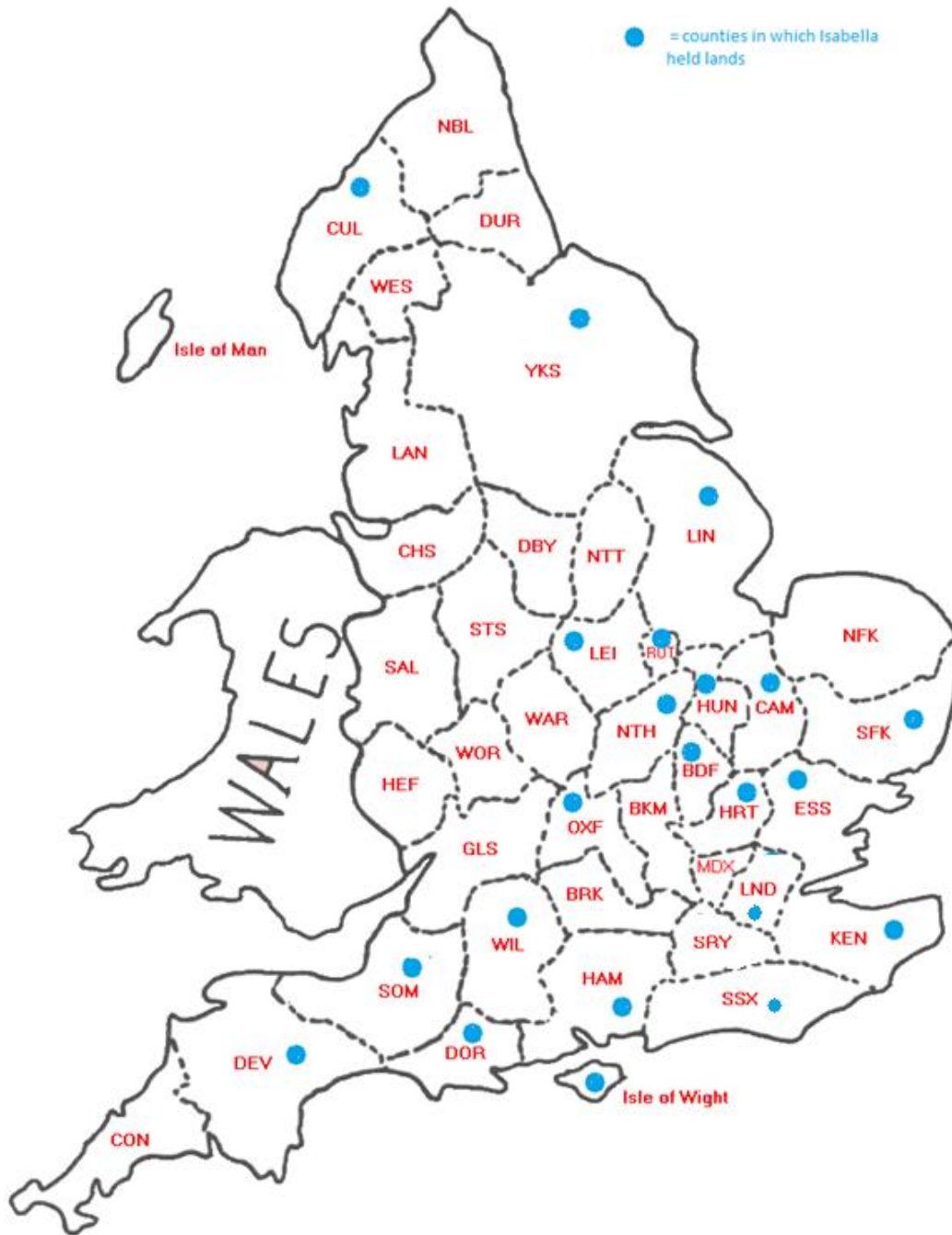
Figure Two: The counties in which Isabella de Forz held land.