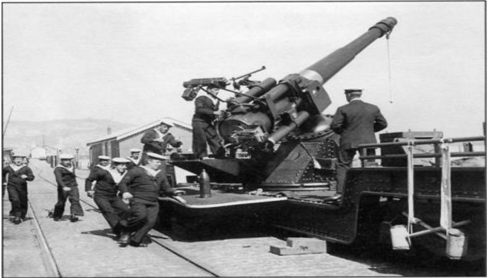
A Royal Navy anti-aircraft gun on the Prince of Wales Pier in 1915, showing the track to the original terminus of the Seafront Railway. A temporary station was erected here when Hamburg-America and Red Star Transatlantic liners called at Dover Harbour for a short period in the early 1900s.